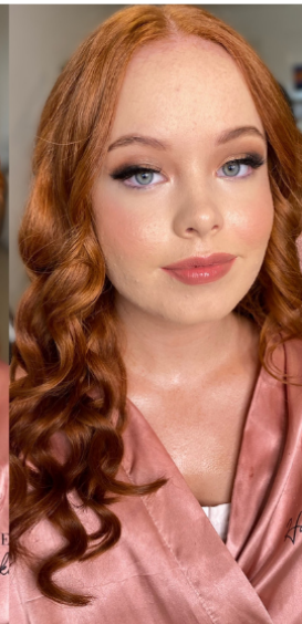
WARM TONES FULL GLAM