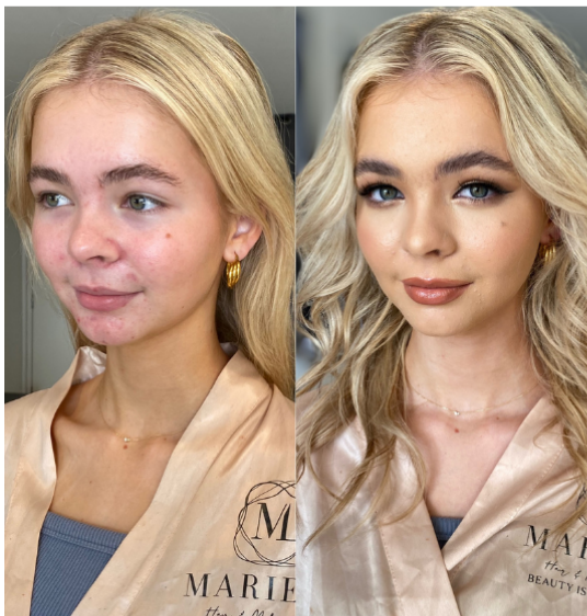
GOLDEN BRONZE SOFT GLAM