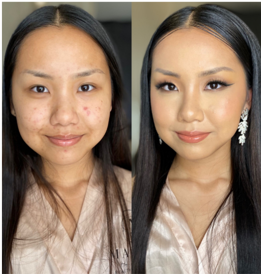
BROWN AND GOLD GLAM