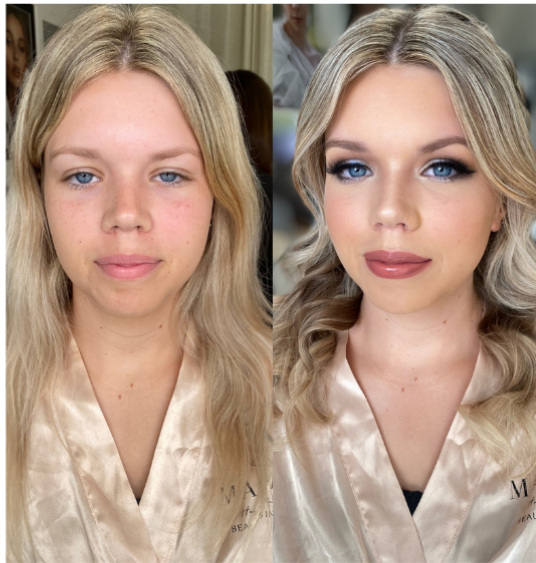
COOL TONE WITH A TOUCH OF BLUE GLAM