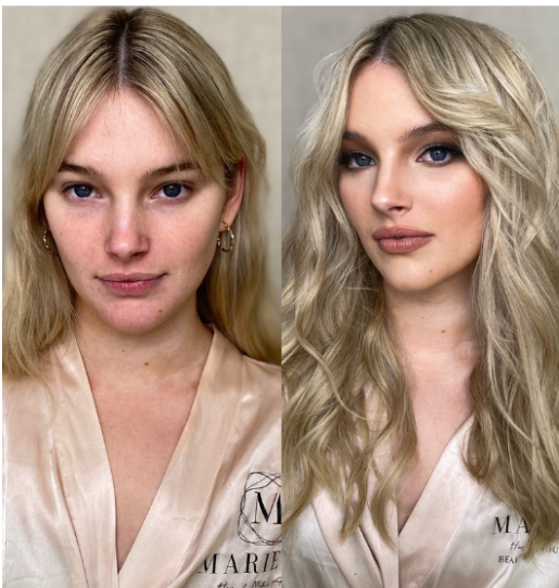
BROWN NUDE FULL GLAM