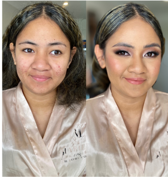
COOL TONE GLAM