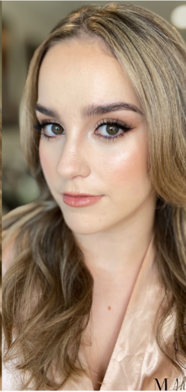
SOFT GLAM NEUTRAL TONE