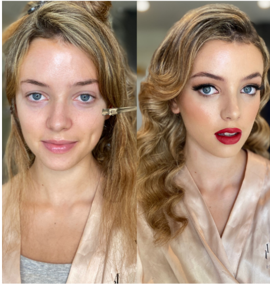
RED LIPS GLAM