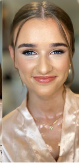
WARM BRONBZE & CHAMPAGNE FG