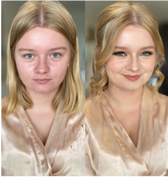
BRONZE AND GOLD SOFT GLAM