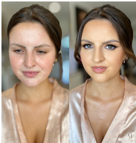
NUDE SOFT GLAM