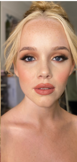
WARM BRONZE GLAM