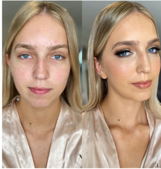
BRONZE & CHAMPAGNE GLAM