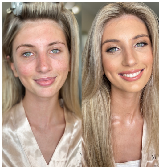
CHAMPAGNE TONE SOFT GLAM